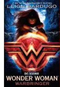
Wonder Woman: Warbringer by Leigh Bardugo